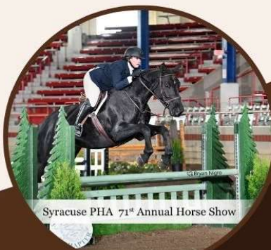
Syracuse PHA 71 st Annual Horse Show